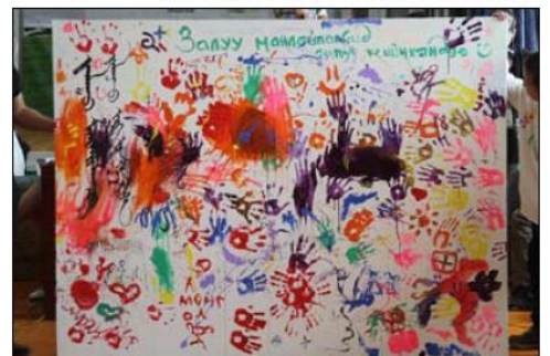
Joint artwork by Young leaders & Children

They organized the One day event program, which consisted of music and dance performances, drama, contortion, painting, calligraphy, fashion, photography and video. It was a complex arts