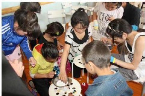
Children are making puppets

A networking e-list for artists to share and exchange ideas was created by ACM. The artists involved in the program will also learn to develop their own marketing and promotion strategy for their work and as result, The Fabulous Club www.thefclub.mn blog site is updated with new entries and portfolios of newly joined artists.