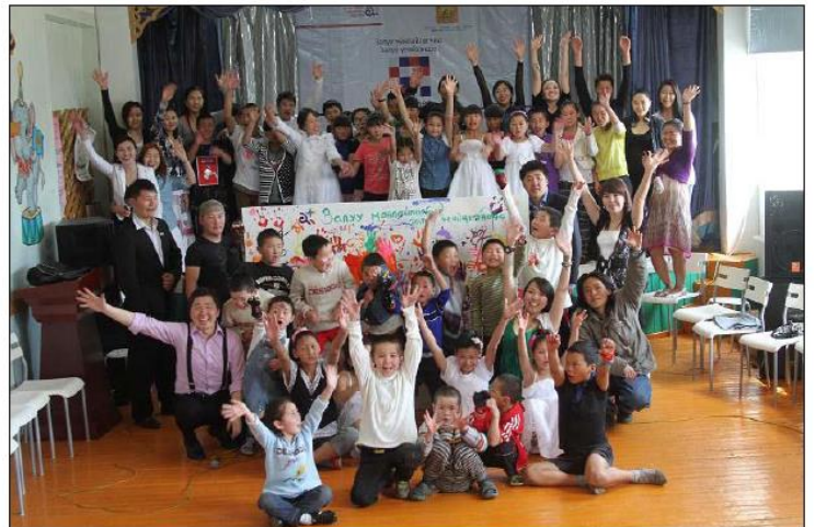
Participants of the 'Young Arts Leaders for Youth'

ACM has provided a 10 part mentoring program on arts administration and leadership skills and provided access to international festivals and networking opportunities. The major focus of the program is